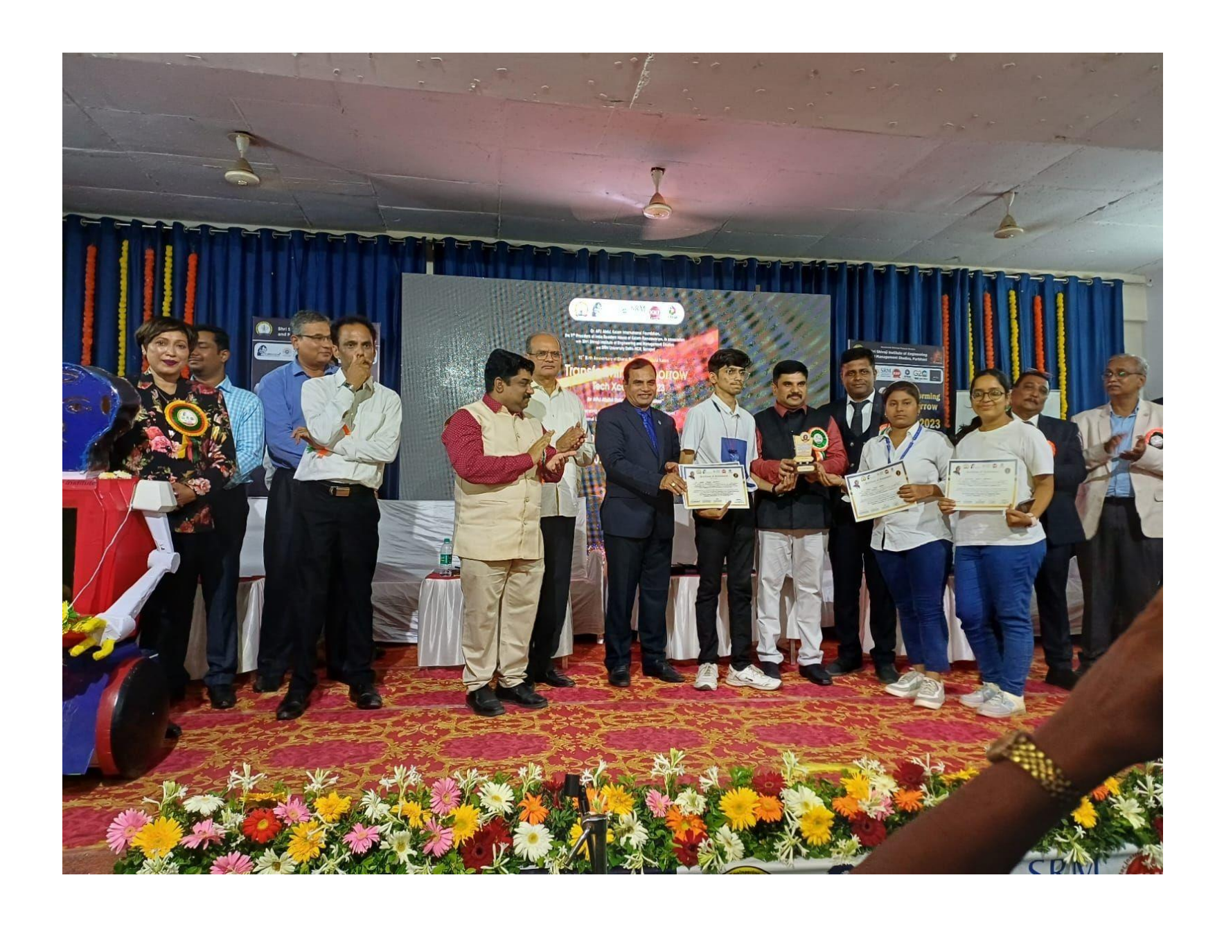
Students of SSIEMS Parbhani Receiving Certificates for Participation in 150 PICO Satellite Event